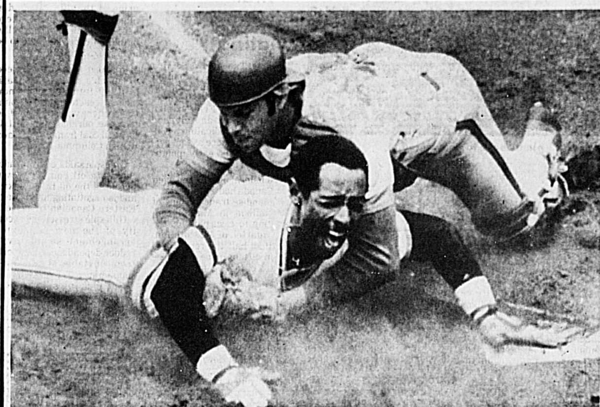
Mets' catcher John Stearns uses a wrestling hold to prevent Giants' Billy North from scoring in a Sunday game.