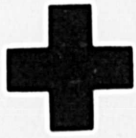
Canadian Red Cross Society

A head without a hat can account for 60% of body heat loss.