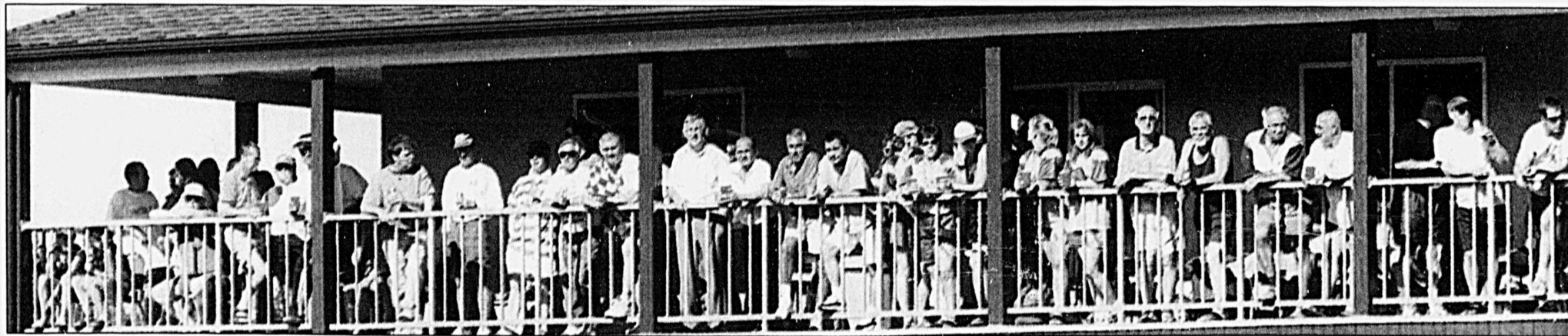
Fans packed the balcony of the North Cariboo Senior Men's Soccer League clubhouse to watch the action.