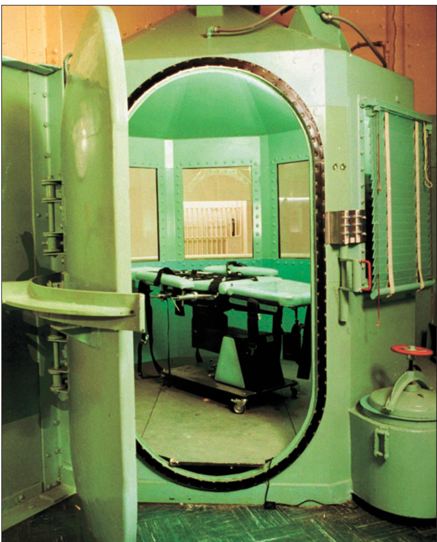
The entrance to the execution chamber and the lethal injection table at California's San Quentin State Prison in San Quentin, Calif. Gov. Arnold Schwarzenegger on Monday refused to spare the life of Stanley Tookie Williams, the founder of the murderous Crips gang.

sincere, or is it just a hollow promise?" Schwarzenegger wrote less than 12 hours before the execution.