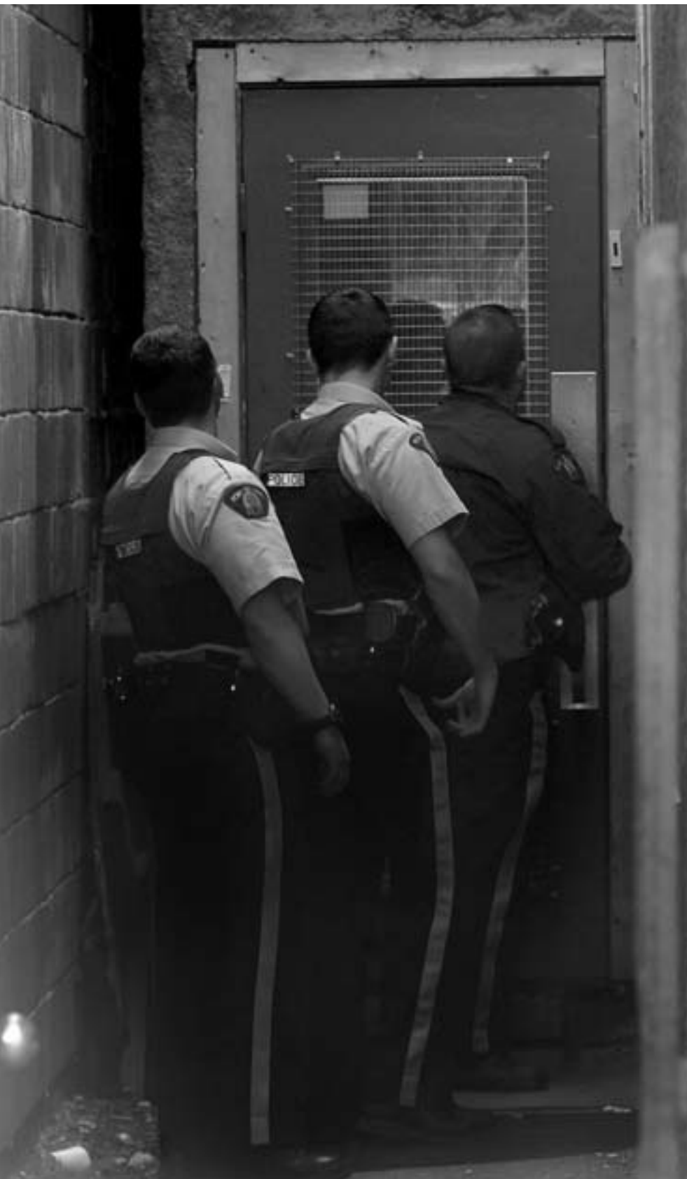
MANHUNT — A Sunday robbery near Knox United church had Prince George police scouring downtown for a suspect. A contingent of RCMP fanned out around the area trying to locate the lone male. The incident took place at about 4 p.m. with the suspect reportedly fleeing on foot. By 5 p.m. new information suggested he had made it to a vehicle and a description was relayed to investigators, who were still following up as of press time.