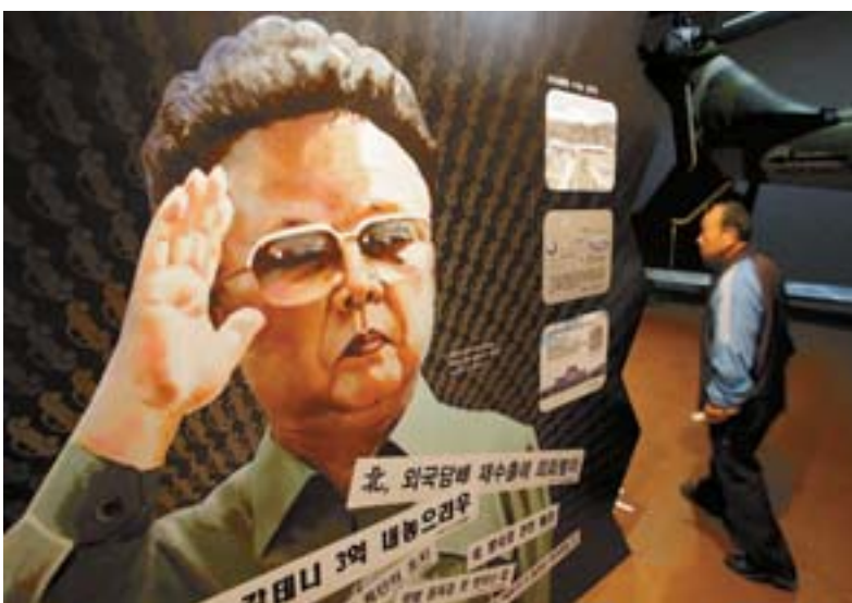
A tourist looks at a painting of North Korean leader Kim Jong Il, who made his youngest son a four-star general, giving the 28-year-old his first known official title in a promotion seen as confirmation that he is slated to become the country's next leader.

At Tuesday's meeting, Kim Jong Il was re-elected to the party's top position of general secretary. State media gave no further details on what was discussed or decided.