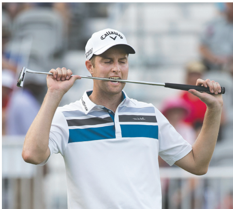
Chris Kirk bites his club after missing a putt for birdie on the 18th hole during first round of play in the Tour Championship golf tournament Thursday in Atlanta.