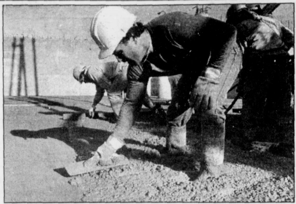
Three of the four concrete quadrants are done.

going right now in hockey, (the club and Riverside Coliseum) aren't getting along as well as they'd like. There have been problems with Saskatchewan Place in Saskatoon since day one, and we're trying to avoid those. The spirit of goodwill exists on both sides - we want to be here forever and the city wants to keep us here forever."