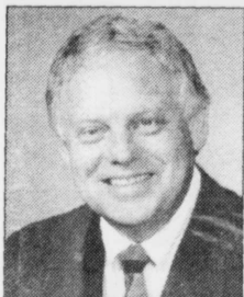
Richard M. (Dick) Harris M.P. for Prince George-Bulkley Valley

May the love of home and family be yours to cherish at the miracle of Christmas.