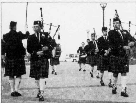
Pipers will be one of the many featured attractions at Gathering of the Clans at Massey Stadium.