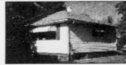
5 BEDROOMS, 2 BATHS 1064 sq ft, large garage, OSBE, large rear deck, RV parking. Reduced to $124,900. (#78163) Call DAVE VARDY 960-9911.