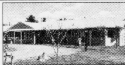
149 ACRE FARM with 2100 sq ft deluxe home, barn & 36 x 56 ft shop. $240,000. Phone DAVE VARDY 960-9911.