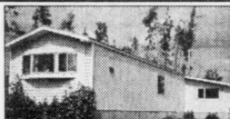
55 ACRES IN THE CITY 14 x 70 mobile home, new garage, 2 barns. Asking $149,500. Call DAVE VARDY today 960-9911. (#76016)