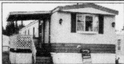
14 X 70 MOBILE HOME 3 bedrooms, in excellent shape. Asking $42,900. Call DAVE VARDY today.