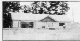
895 SQ FT HOME IN CENTRAL FORT GEORGE hardwood floors, sunken living room, updated kitchen, 3 bedrooms. Reduced to $94,000. (#79161)