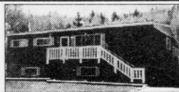
1420 SQ FT, 4 BEDROOMS, 2 BATHS On .34 acre. Wonderful new kitchen. Call DAVE VARDY to view 960-9911. (#72467) Charella/Davis Rd area. $131,900.