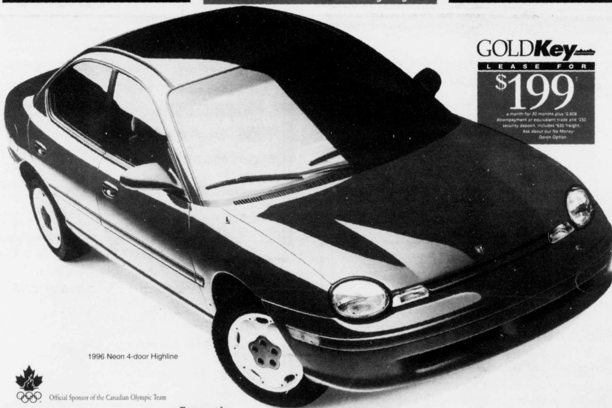
1996 Neon 4-door Highline

GOLDKey LEASE FOR $199 a month for 30 months plus $2,600 downpayment or equivalent trade and 250 security deposit includes $40 freight. Ask about our No Money Down Option