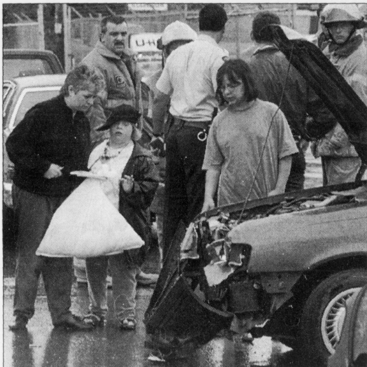
Traffic was blocked on Friday afternoon when a car pulling out of an alley was hit by a Jeep travelling south on Queensway.