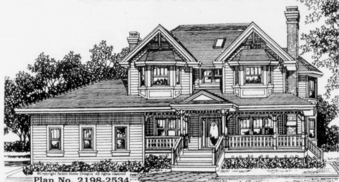
Plan No. 2198-2534