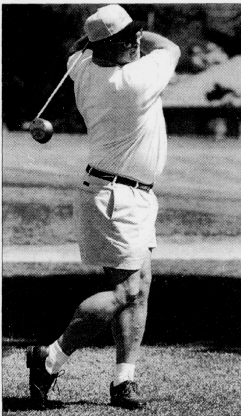
Whether you're a scratch golfer heading into tournament play or a duffer, Prince George has more options than ever for the grassy game.

The Texas Scramble on May 29 to June 1 is the first big tournament. Others include the Prince George Savings Amateur (formerly Men's Simon Fraser) and the Ladies' Simon Fraser.