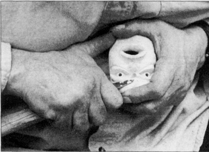
A yellow cedar mask carved by Dwayne Williers at CNC on Tuesday.

"The exhibit at UNBC is going to try to relate issues of cultural genocide. It is drawing a parallel between what happened in the Holocaust back then and what is happening now in places like