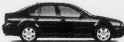
The Volkswagen Jetta Most Appealing Entry Midsize Car as ranked by J.D. Power and Associates.