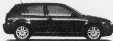
The Volkswagen GTI Most Appealing Sporty Car as ranked by J.D. Power and Associates.