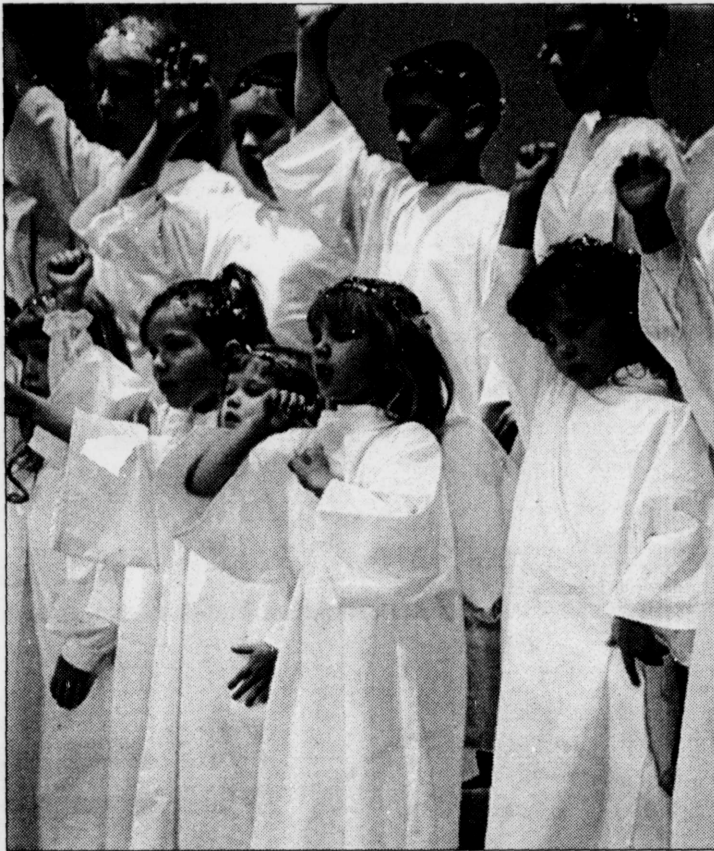
The Herald Angel's sing of the birth of Jesus in Lakewood Alliance Church's Christmas pageant.