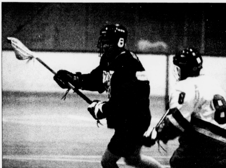
The Excel Transport Bandits came back in overtime to beat the Cap Abilities Oldstylers 13-12 on Wednesday night.