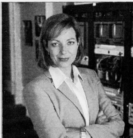
C.J. (Allison Janney) tries to find out which of her colleagues is behind a written attack on the Bartlet administration in "The West Wing" Wednesday on NBC.