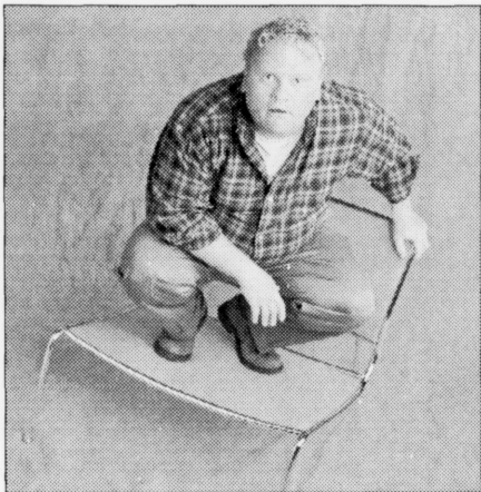
Larry Joe Campbell plays Andy, the brother-in-law and co-worker of Jim, in "According to Jim," airing Wednesdays on ABC.