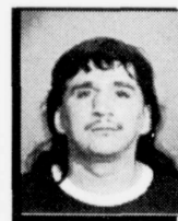
FAYANT Percy Andres

Crime Stoppers needs your help in locating the following male who is wanted on Warrants. As of 10:17 pm this 29th day of November 2001, Trevor Gene ANTONE (BD: 1976-June-02) is wanted on a Warrant for Sexual Assault and Fail to Appear. ANTONE is described as a non-white male, 175 cm or 5' 09" tall and weighs 68 kg or 151 lbs. ANTONE has long black hair and Brown Eyes. ANTONE should be considered violent.