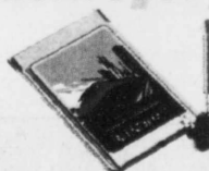
AirCard 555 For Laptops