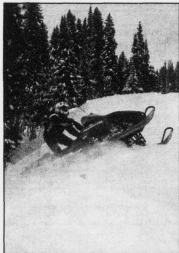
Riding in the North Fraser area.