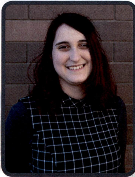
Amber Boileau Photographer, Cover Artist